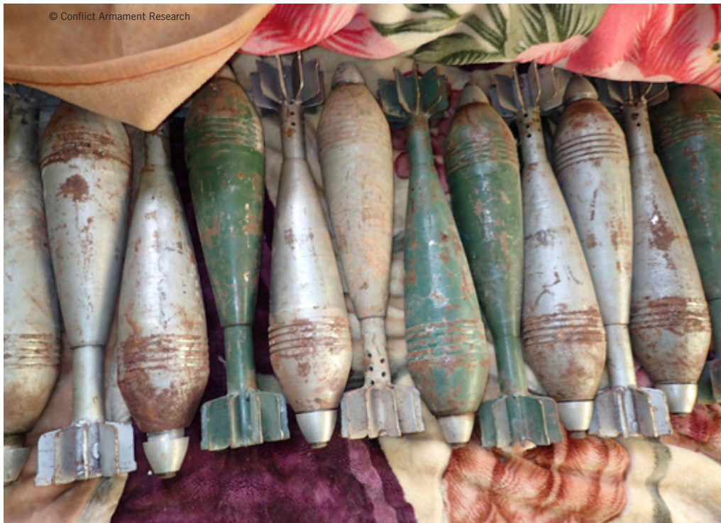
Improvised mortar rounds manufactured by IS forces and captured by Syrian Kurdish People's Protection Units documented by a Conflict Armament Research Field Investigation team on 21 February 2015 in Kobane.

IS captured an unknown quantity of 155mm M198 towed howitzers from Iraqi military stocks during its capture of Mosul in June 2014, along with the older Chinese Type 59-1, which the Iraqi army used extensively during the 1980-1988 Iran-Iraq war. 23 IS has also captured former Soviet Union D-30 and M-30 122mm howitzers from Syrian military stocks and small numbers of the older, and now obsolete, M-30 models which were probably taken from the Syrian army's reserve storage for deployment.